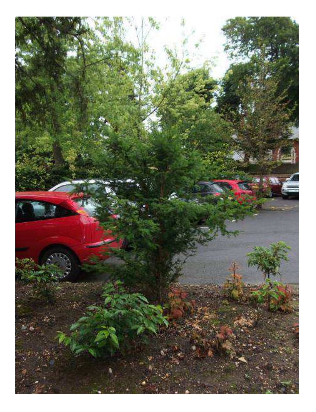
Yew tree proposed to be lifted and transplanted.