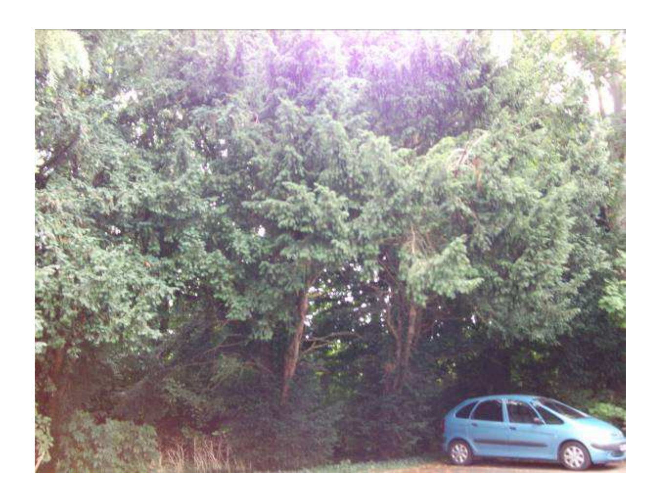
Yew trees proposed to be reduced to 5m in height and faced-up.